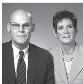
JAMES CARVILLE & MARY MATALIN

The incomparable host of NPR's Peabody award-winning, "Fresh Air". In over 10,000 interviews since 1973, she has elicited secrets, stories and events that have shaped peoples' lives. She will share her insights and humor-sprinkled experiences.