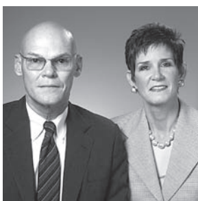
JAMES CARVILLE & MARY MATALIN

The incomparable host of NPR's Peabody award-winning, "Fresh Air". In over 10,000 interviews since 1973, she has elicited secrets, stories and events that have shaped peoples' lives. She will share her insights and humor-sprinkled experiences.