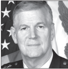
general richard MYERS

Actor, producer, and Academy Award winning director, his enduring contributions to film over four decades have earned him the SAG Lifetime Achievement award and international acclaim. His Sundance Institute and Festival champions American independent cinema.