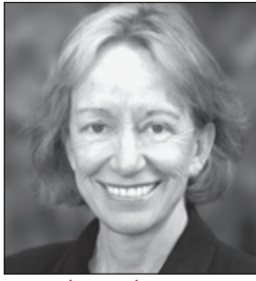
doris kearns GOODWIN

One of the great voices of contemporary literature, she is a passionate and powerful speaker who captivates and mesmerizes with lyrical vigor, fire and perception. Her most recent bestseller is A Song Flung Up to Heaven .