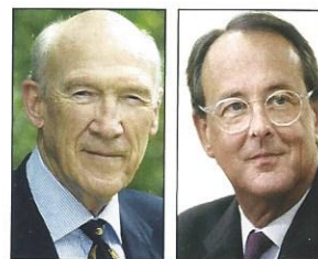
ALAN SIMPSON and ERSKINE BOWLES

Former chancellor of Washington D.C. public schools, subject of cover stories in Time and Newsweek and a prime subject of the movie "Waiting for Superman", Michelle Rhee is considered by many to be the catalyst for change needed in the American education system. She will give us her insight into bringing change to the D.C. school system and her new venture in effecting change through the political process.