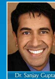
Dr. Sanjay Gupta