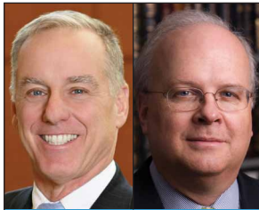
Howard Dean Karl Rove