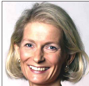
Zanny Minton Beddoes

A successful governor and business, economic, education and health care reformer, Jeb Bush elevates the conversation on addressing challenges facing America today. One of America's most experienced reformers, Bush led change by inspiring citizens, businesspeople and policy makers. He is chairman of the Foundation for Excellence in Education, a national foundation focused on education reform.