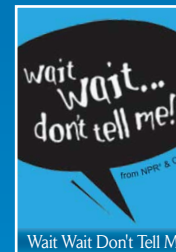
Wait Wait Don't Tell Me