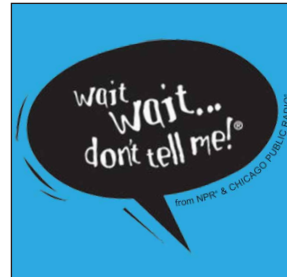
Wait Wait Don't Tell Me

Called "America's new past master" and "the best of the new generation of American historians," Dr. Douglas Brinkley is a distinguished professor of history at Rice University and a fellow at the James A. Baker III Institute for Public Policy. Appearing the week of the presidential election he will provide a unique perspective on our times and our place in history.