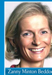
Zanny Minton Beddoes