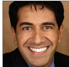
Dr. Sanjay Gupta

Zanny Minton Beddoes is The Economist's economic editor, overseeing the prestigious publication's American and global economic coverage since 1994. Previously an economist at the International Monetary Fund (IMF), she worked on macroeconomic adjustment programs in Africa and transition economies of Eastern Europe. Before joining the IMF, she worked as an advisor to the minister of finance in Poland.