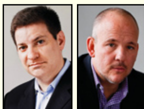
MARK HALPERIN AND JOHN HEILEMANN

OP-ED columnist for the New York Times , analyst on the News Hour with Jim Lehrer and commentator on NPR, David Brooks has a gift for bringing audiences face to face with the spirit of our times with humor, insight and quiet passion. He is a keen observer of the American way of life and will share with us his analysis of present day politics and foreign affairs.