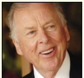
T. BOONE PICKENS

Co-founder and editor-in-chief of The Huffington Post , nationally syndicated columnist, author of twelve books and co-host of NPR's Left, Right and Center , Arianna Huffington is among the most influential observers of the political scene. She will share with us her thoughts on the new media and how technology is changing the way we think, learn, play, work and vote. Famous for her outspoken opinions, she will also provide her impressions of some of the potential candidates in the upcoming presidential election.