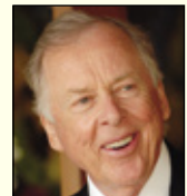
T. Boone Pickens