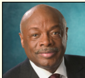
WILLIE BROWN, JR.

Halperin and Heilemann are co-authors of New York Times best seller Game Change , the definitive book on the 2008 election. Mark Halperin is editor at large and senior political analyst for Time magazine and was formerly political director for ABC News. John Heilemann is national political correspondent and columnist for New York magazine. They will give us their insight on the mid-term elections, some of their experiences in writing Game Change and an early peek into the 2012 presidential race.