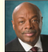
Willie Brown, Jr.